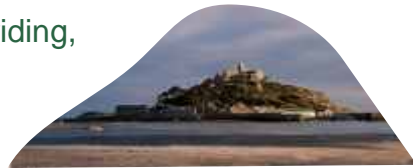
St Michael's Mount