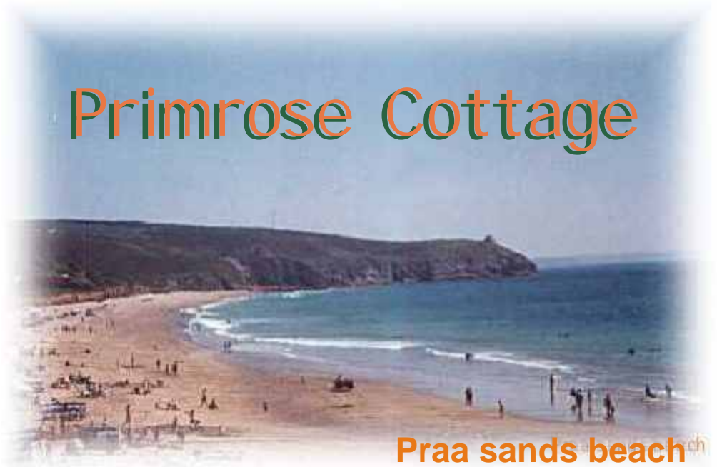
Praa sands beach

From Helston follow the road to Penzance for approx. 1 mile, turn right at Hilltop Garage (Jet) onto the B3302 to Hayle. After ¾ mile take the second left to Carleen (Just after the shop). Primrose Cottage is ½ mile down this lane.